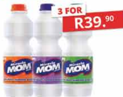
MIRACLE MOM 1lt - ASSORTED