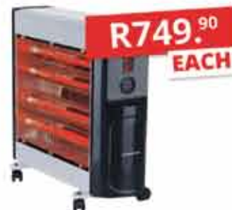
6 QUARTZ HEATER 4 HEAT SETTINGS - 2200W sc114347