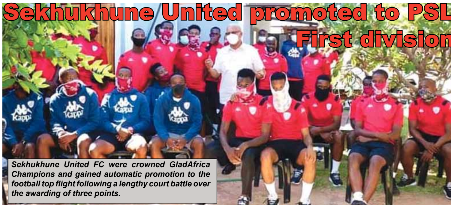
Sekhukhune United FC were crowned GladAfrica Champions and gained automatic promotion to the football top flight following a lengthy court battle over the awarding of three points.