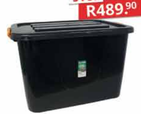
UTILITY BIN 150lt BLACK sc65862