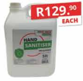
5lt HAND SANITISER 70% ALCOHOL sc126009