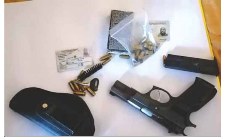
Unlicensed firearms, ammunition and other weapons were confiscated by the police during the operations.