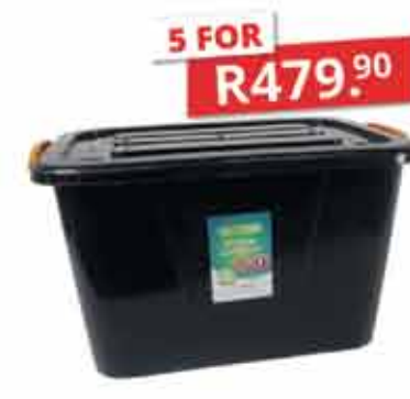
85lt STORAGE BOX WITH LOCK LID & WHEELS sc71677