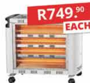
6 QUARTZ HEATER - 4 HEAT SETTINGS sc114340