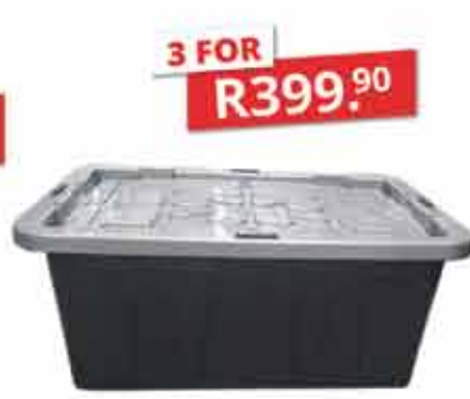
100lt UTILITY BOX BLACK BASE RECYCLED sc86206