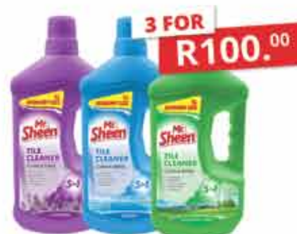
SHIELD TILE CLEANER 1l ASSORTED