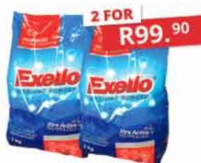
EXELLO WASHING POWDER 3kg sc109827