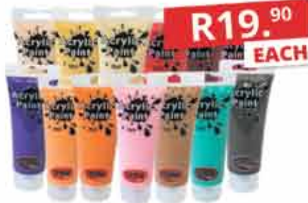
CRAZY CRAFTS ACRYLIC PAINTS 75ml