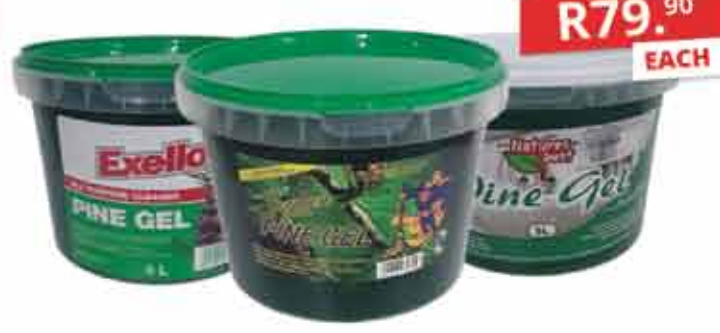
5lt PINE GEL ASSORTED OPTIONS IN-STORE