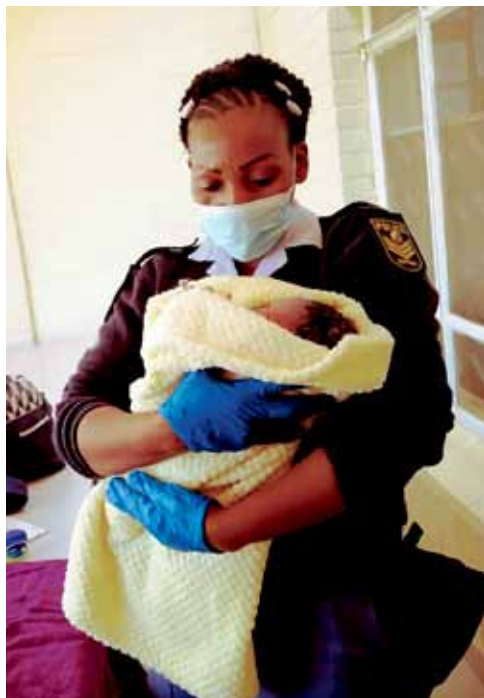
The Limpopo Department of Health is worried about increasing number of pregnant women giving birth before arriving at health facilities, following reports of a heavily pregnant woman giving birth at Roedtan Police Station recently.