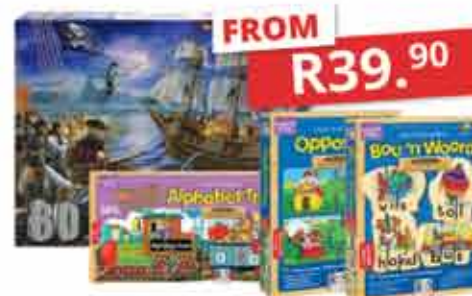
SMART PLAY EDUCATIONAL PUZZLES ASSORTED