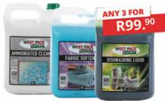
5lt DETERGENTS (AS ABOVE) T&C's APPLY