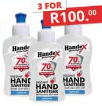
HANDEX HAND SANITISER 250ml sc114020