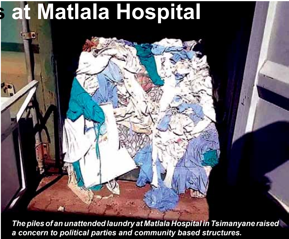
The piles of an unattended laundry at Matlala Hospital in Tsimanyane raised a concern to political parties and community based structures.

For the past six months, piles of dirty linen and clothing, have been seen dumped outside Matlala Hospital in Tsimanyane outside Marble Hall. This is because the service provider, who was contracted by Limpopo Department of Health to attend to the hospital’s laundry, claim his trucks are broken, despite being fully paid for no work done. The hospital situation poses a serious shortage of clothing, resulting in patients being told to inform their relatives to bring along