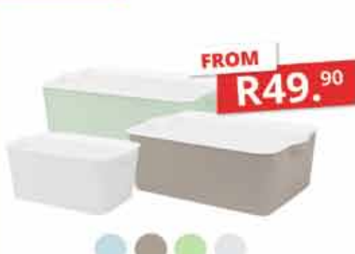
VENUS STORAGE BOX WITH WHITE LID SMALL R49.90 | MEDIUM R89.90 | LARGE R99.90