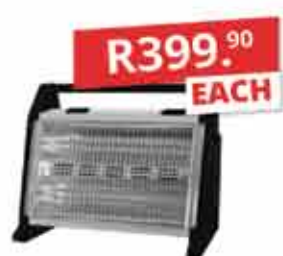
4 QUARTZ HEATER - 2 HEAT SETTINGS sc114346