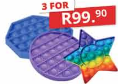
FIDGET POP IT TOY | R49.90 EACH