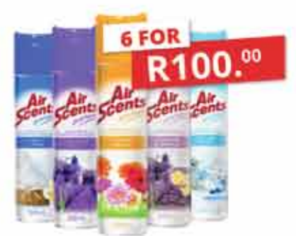
AIR ENHANCER 200ml