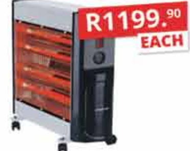
6 QUARTZ HEATER 4 HEAT SETTINGS - 2600W sc114347