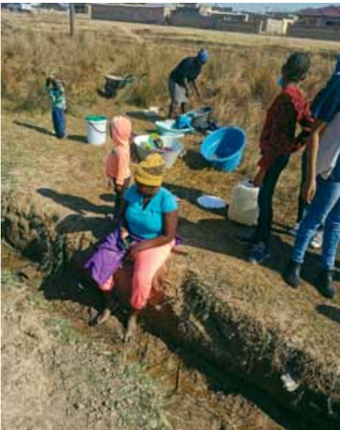
The DA calls for SAHRC to intervene in the water crisis issues facing Ephraim Mogale Local Municipality, after residents were found drawing dirty water for drinking purposes.