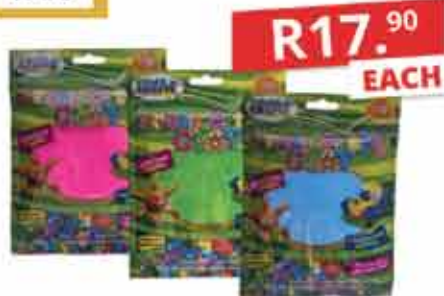
CRAZY CRAFTS CLAY 50ml ASSORTED COLOURS