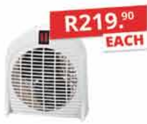
FAN HEATER - 2000W sc114349